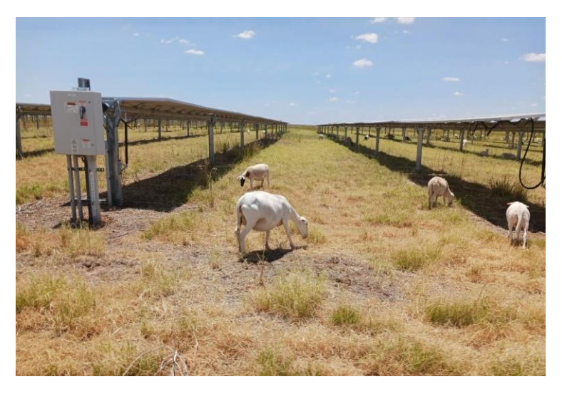
Fig 1. Revegetation substantially reduces the small temperature increases under a solar array